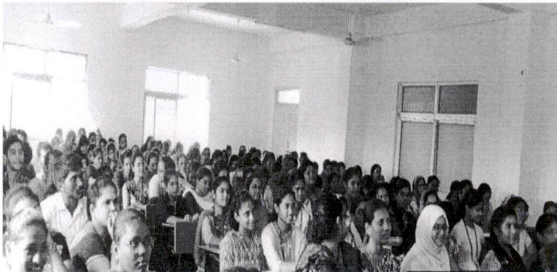
All the faculty members of NPC and girl students participated in this event on 16/2/2022