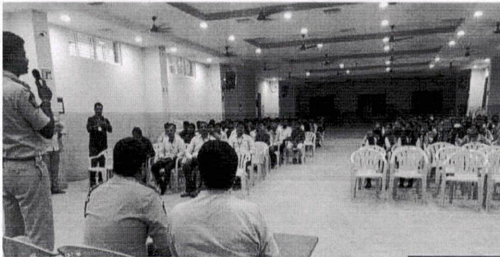
All the girl students and woman faculty are actively participated in this event on 28/02/2020