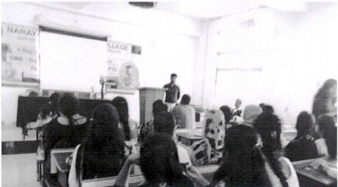
Gender champions club Student delivering valuable speech on 15-01-2020