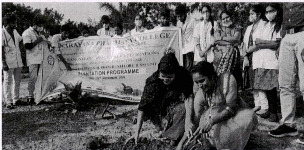
STUDENTS AND FACULTY PLANTING TREE ON PLANTATION PROGRAM CONDUCTED ON 26-11-2021